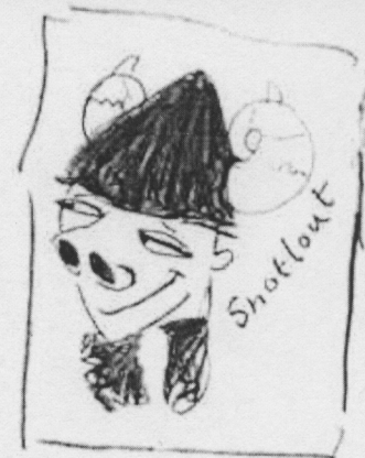
Snotlout as he appears in the book series.